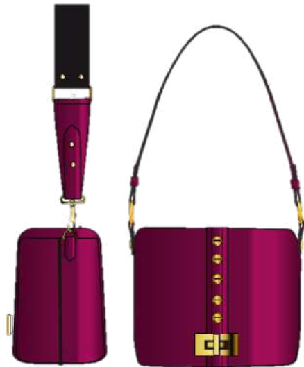
Boxy Bag Buff Harness Dk Pink - Mix Leather

DESIGNED IN PARIS – MADE WITH CRAFTSMANSHIP FROM INDIA