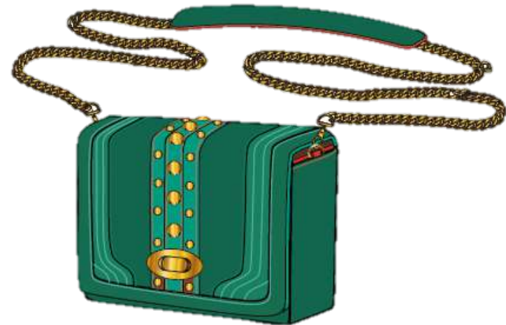
Baby Khan Green - Mix Leather