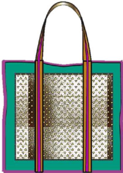
Aerobic Utility Bag – Mix Leather Code: SC800144 15x12x5cm

DESIGNED IN PARIS – MADE WITH CRAFTSMANSHIP FROM INDIA