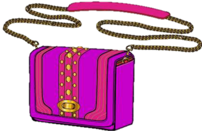
Baby Khan Fuschia - Mix Leather

DESIGNED IN PARIS – MADE WITH CRAFTSMANSHIP FROM INDIA