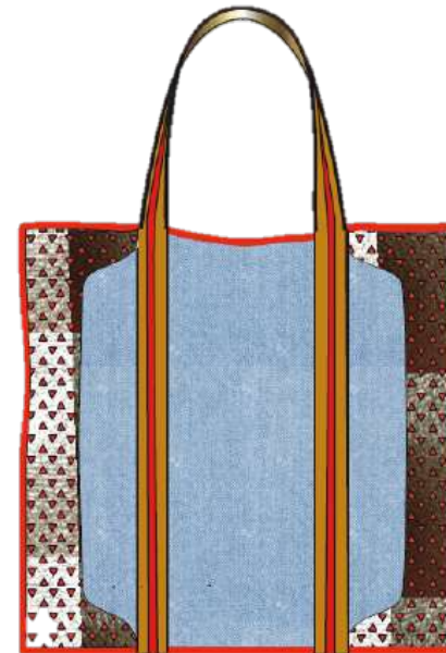
Denim Utility Bag – Mix Leather and Denim Code: SC8081440 15x12x5cm