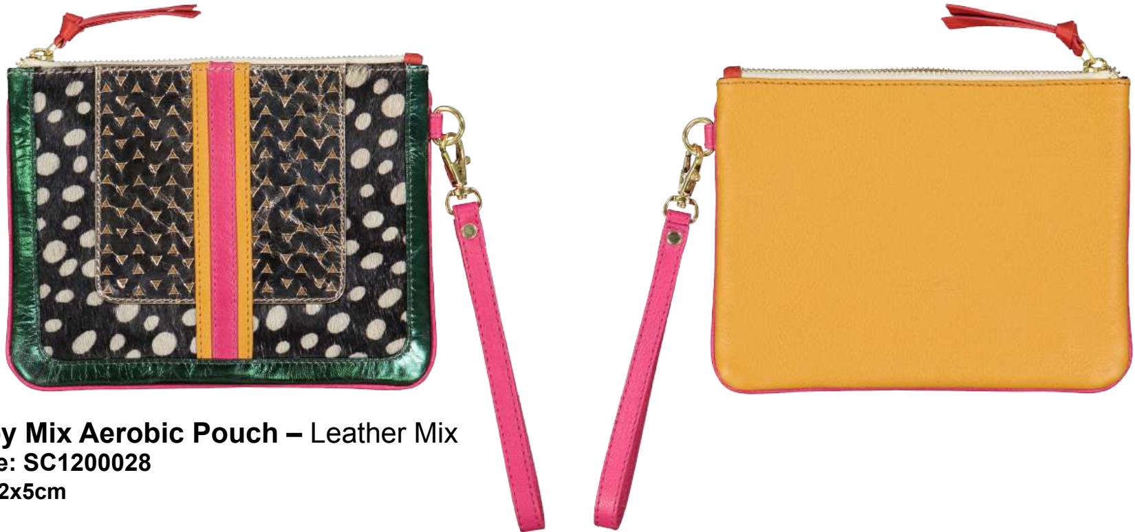
Baby Mix Aerobic Pouch – Leather Mix

DESIGNED IN PARIS – MADE WITH CRAFTSMANSHIP FROM INDIA