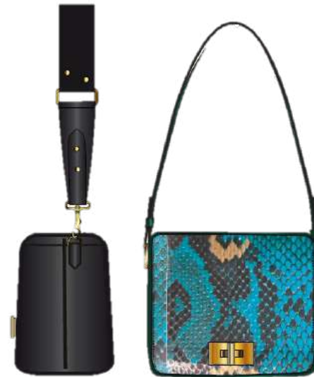
Boxy Bag Buff Harness Green Snake - Mix