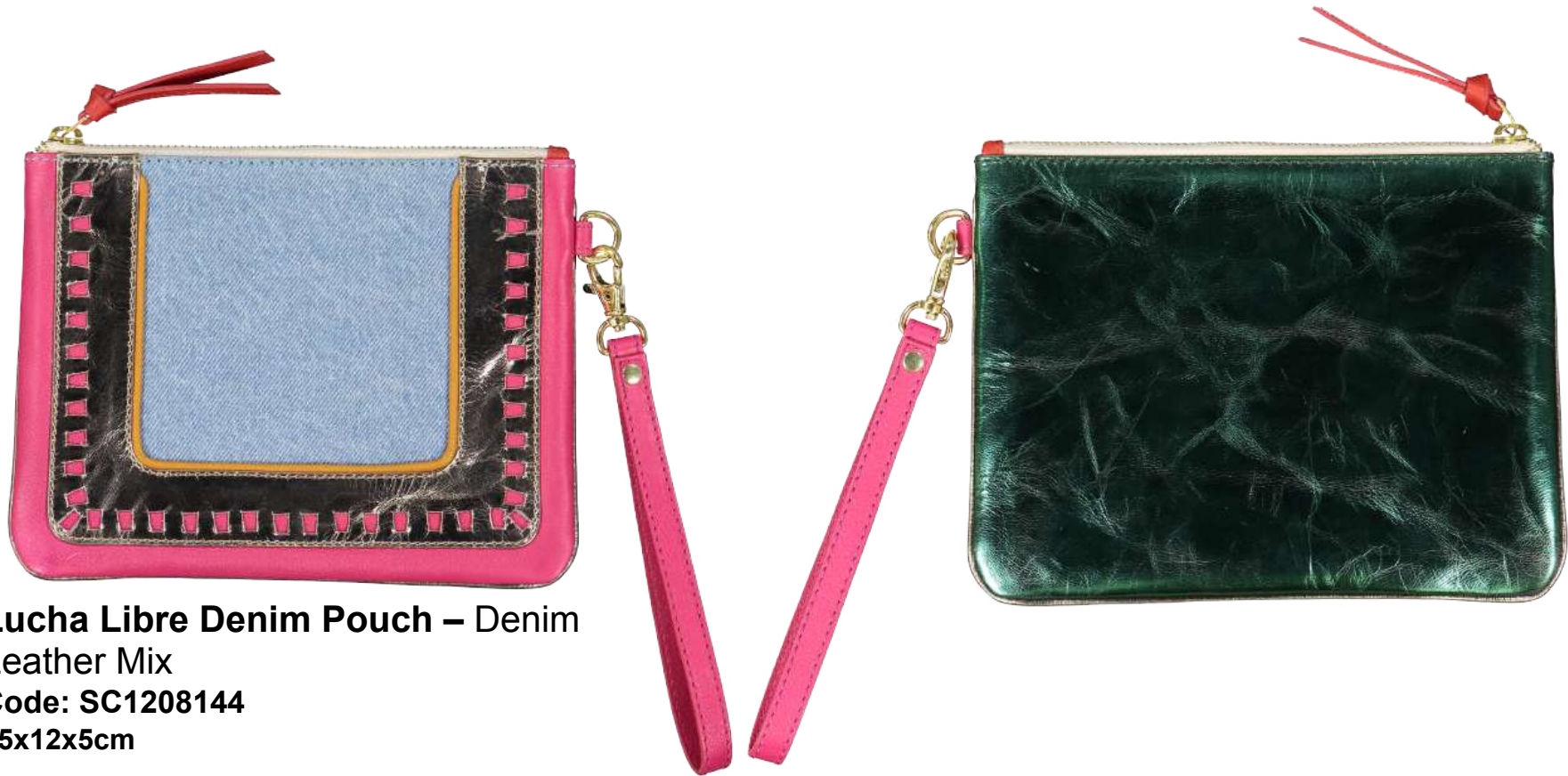
Lucha Libre Denim Pouch – Denim Leather Mix Code: SC1208144 15x12x5cm

DESIGNED IN PARIS – MADE WITH CRAFTSMANSHIP FROM INDIA